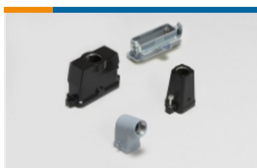
Rectangular Connector Hoods & Bases (445)